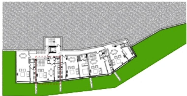
VIVIENDA B1-PA/2 PLANTA BAJA DEL DÚPLEX ESCALA 1/100