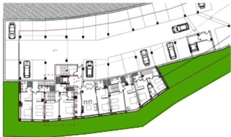
VIVIENDA B1-PA/2 PLANTA PRIMERA DEL DÚPLEX ESCALA 1/100