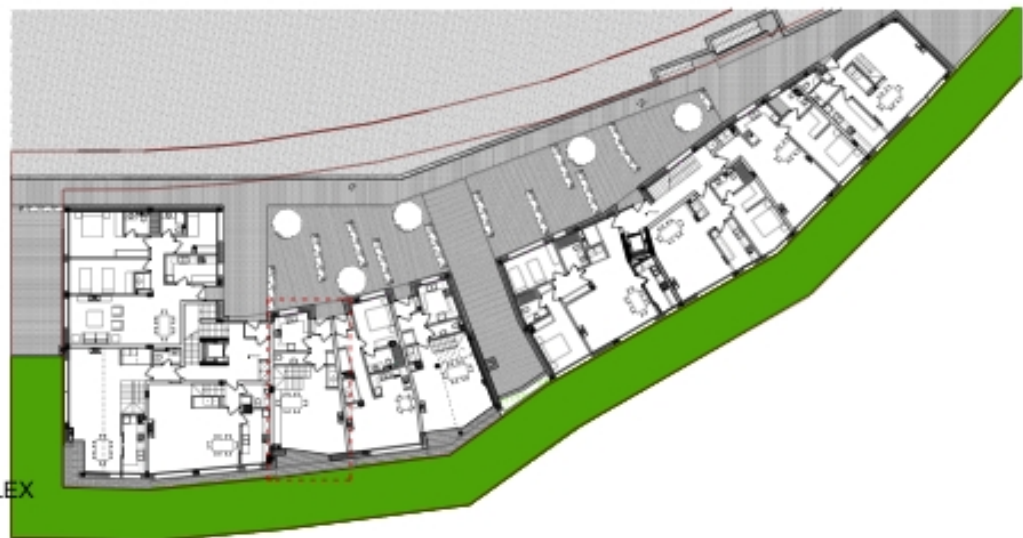
VIVIENDA B1-PC/2 PLANTA BAJA DEL DÚPLEX ESCALA 1/100