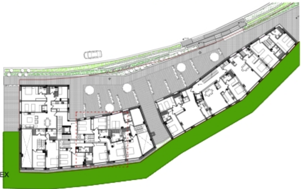
VIVIENDA B1-PC/2 PLANTA PRIMERA DEL DÚPLEX ESCALA 1/100